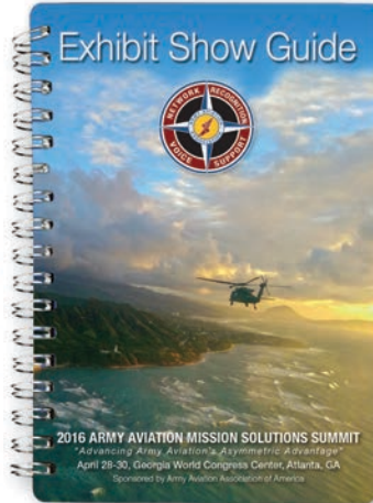
Exhibit Show Guide