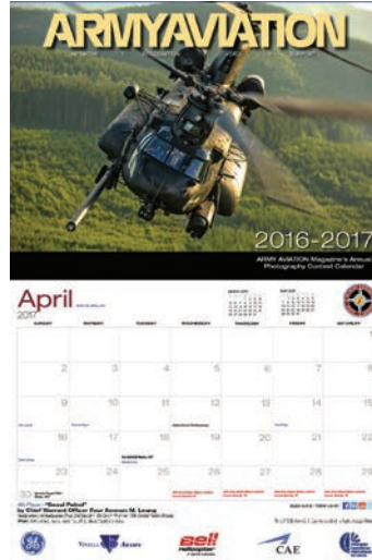
ARMY AVIATION Photo Calendar